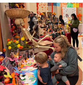
Missouri History Museum - Día de los Muertos

Despite a rainy weekend, we were able to share our resources, raise awareness about our mission, receive donations, and connect with many community members who were eager to learn about our work. The experience reinforced the value of being present in the community and building meaningful connections that extend our impact.