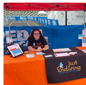
Pedal the Cause - St. Charles, MO